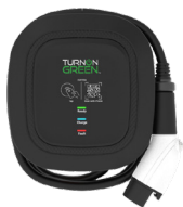
EV Charging Hardware