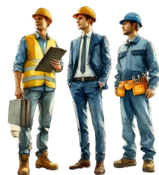
Vast Network of Contractors

Contact us today to discuss your EV charging project.