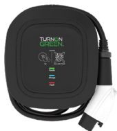
EV Charging Hardware